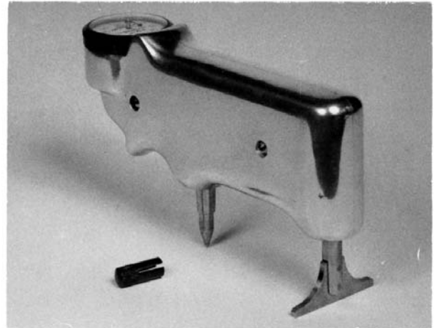
FIG. 1 Barcol Impressor, Model 934-1